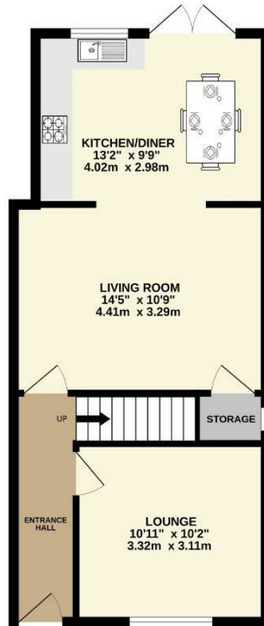
GROUND FLOOR 474 sq.ft. (44.0 sq.m.) approx.