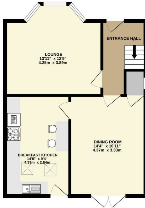
GROUND FLOOR 525 sq.ft. (48.8 sq.m.) approx.