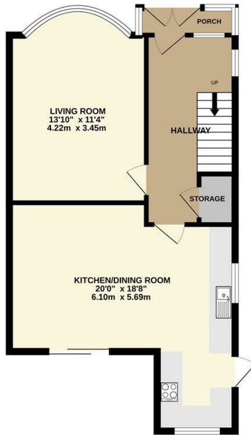
GROUND FLOOR 561 sq.ft. (52.1 sq.m.) approx.