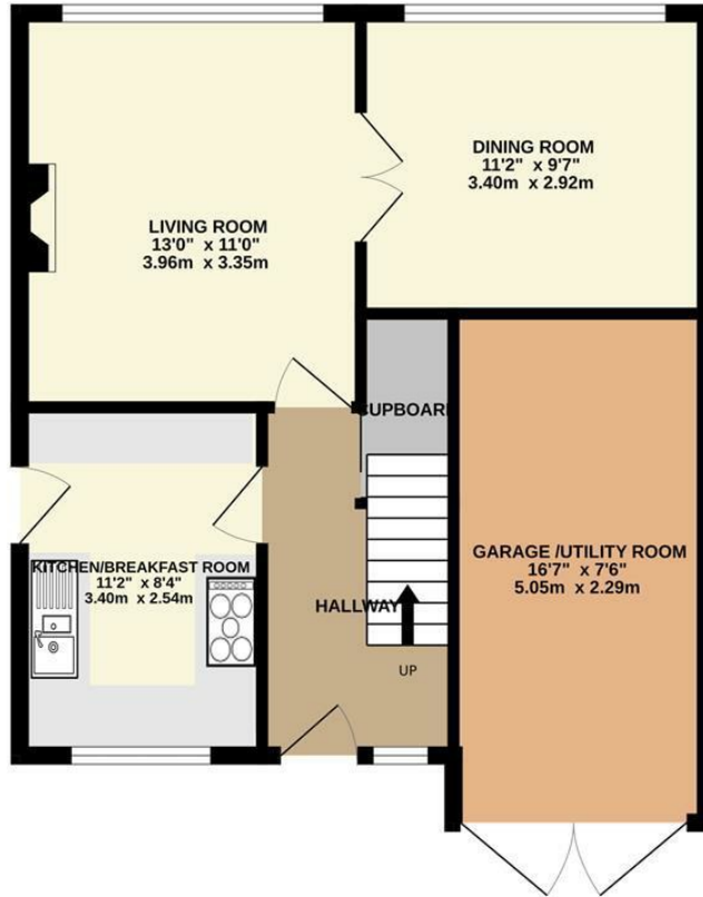
GROUND FLOOR 544 sq.ft. (50.5 sq.m.) approx.