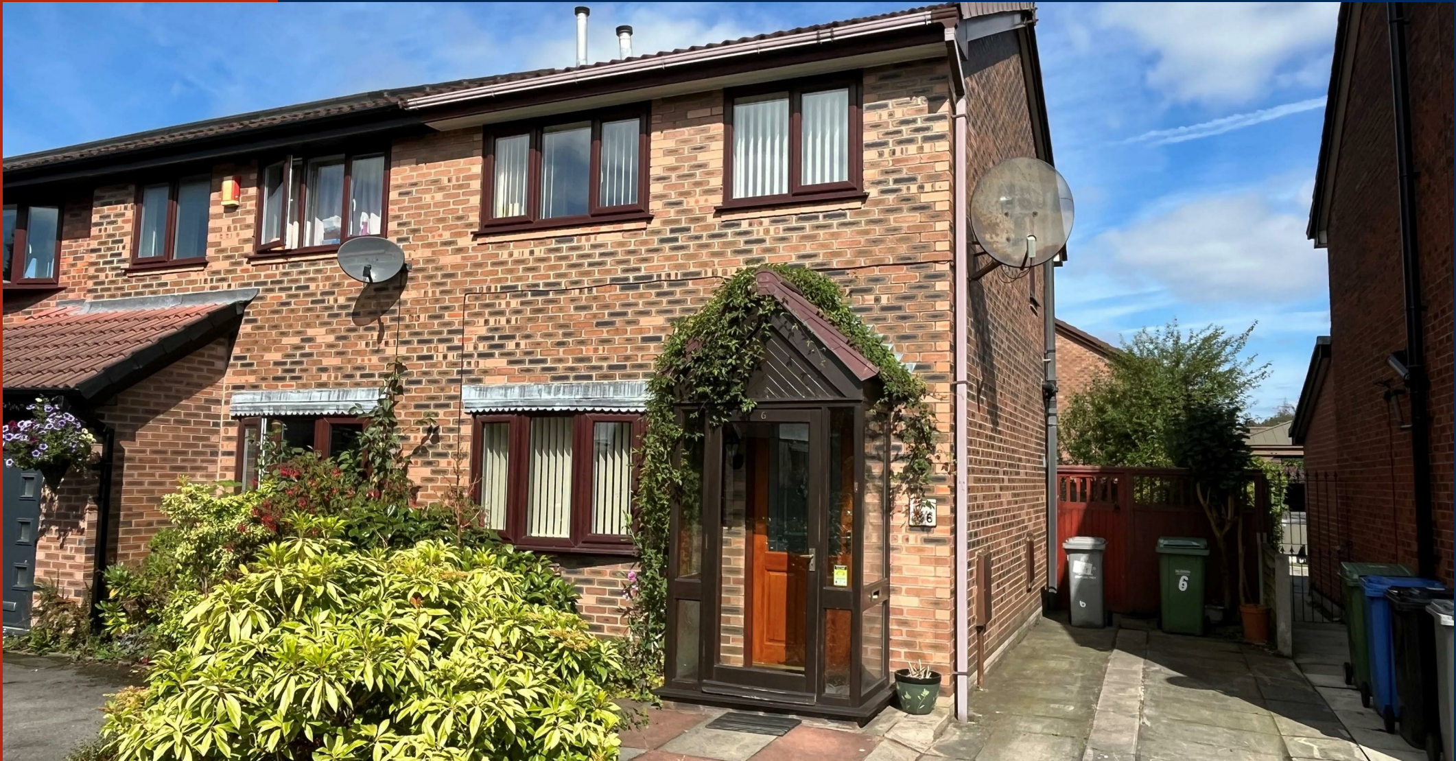
6 Cornfield Close, Sale, M33 2LH