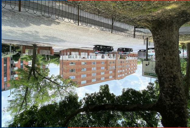
EPC Rating - C