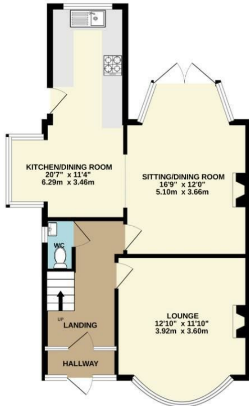
GROUND FLOOR 642 sq.ft. (59.6 sq.m.) approx.