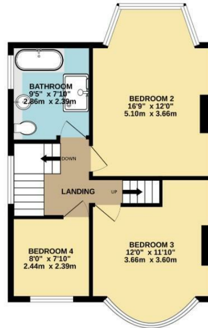
1ST FLOOR 536 sq.ft. (49.8 sq.m.) approx.