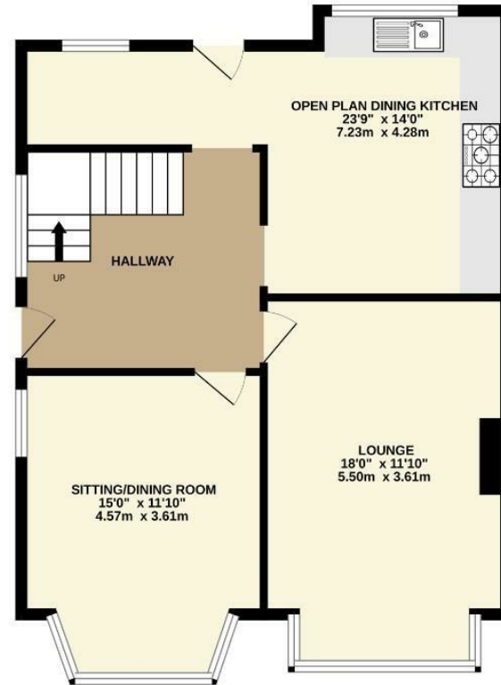
GROUND FLOOR 720 sq.ft. (66.9 sq.m.) approx.