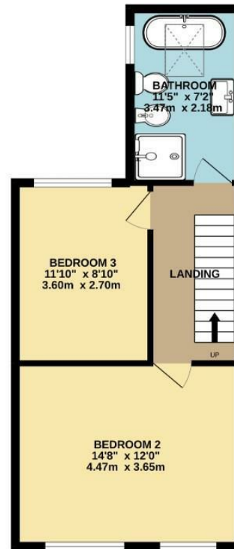
2ND FLOOR 238 sq.ft. (22.1 sq.m.) approx.