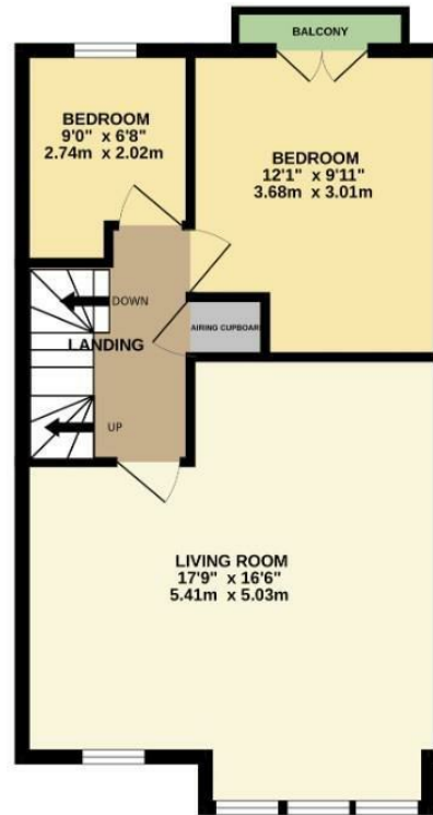
1ST FLOOR 477 sq.ft. (44.3 sq.m.) approx.