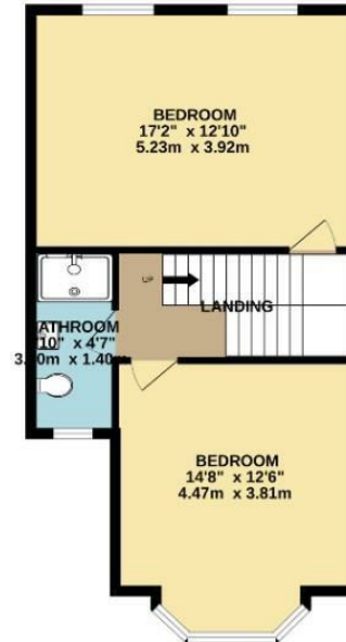
2ND FLOOR 510 sq.ft. (47.4 sq.m.) approx.