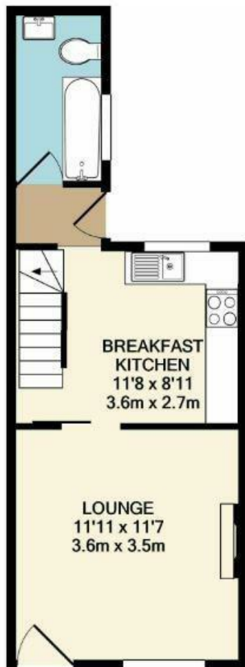
GROUND FLOOR APPROX. FLOOR AREA 300 SQ.FT. (27.9 SQ.M.)