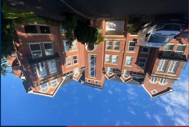
EPC Rating - B