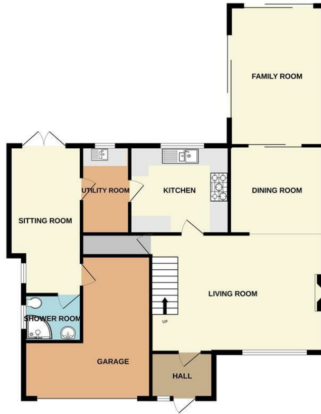
GROUND FLOOR 1114 sq.ft. (103.5 sq.m.) approx.