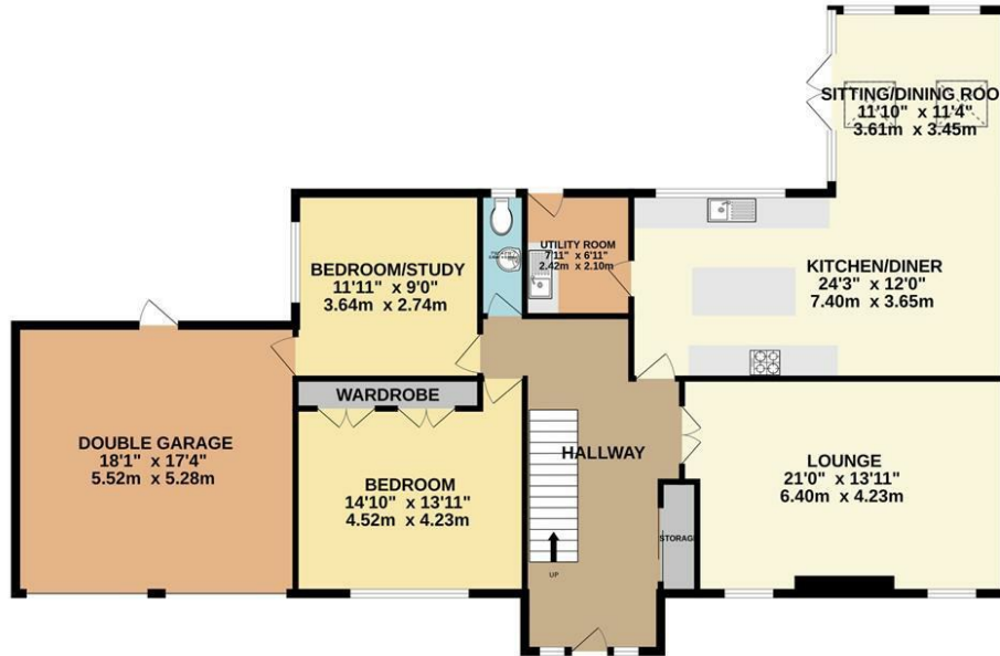
GROUND FLOOR 1664 sq.ft. (154.6 sq.m.) approx.