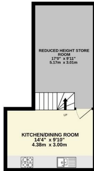
LOWER GROUND FLOOR 309 sq.ft. (28.7 sq.m.) approx.