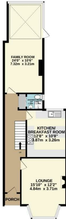
GROUND FLOOR 734 sq.ft. (68.2 sq.m.) approx.