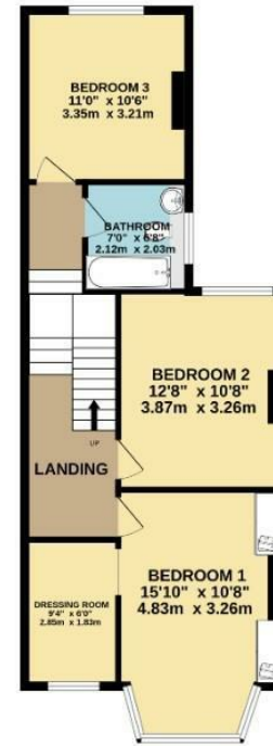
1ST FLOOR 635 sq.ft. (59.0 sq.m.) approx.