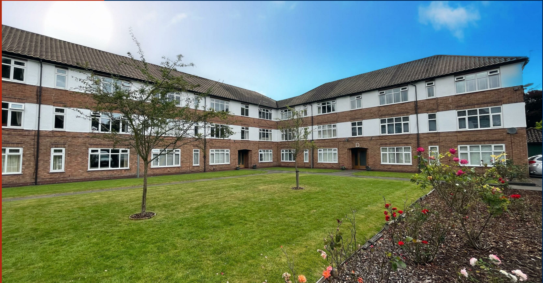
Flat D6 Harewood Court, Lyme Grove, Sale, M33 3WW