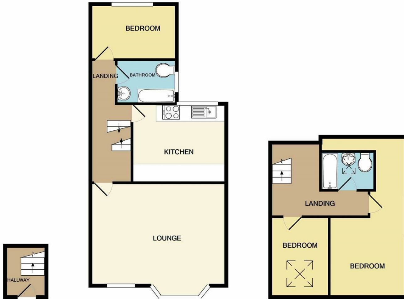
GROUND FLOOR APPROX. FLOOR AREA 34 SQ.FT. (3.2 SQ.M.)