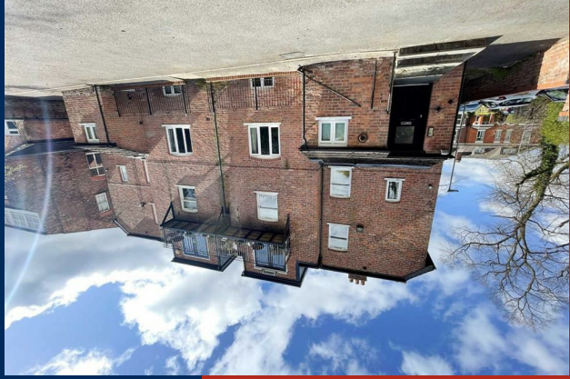
EPC Rating - B

Available with Deposit No deposit needed