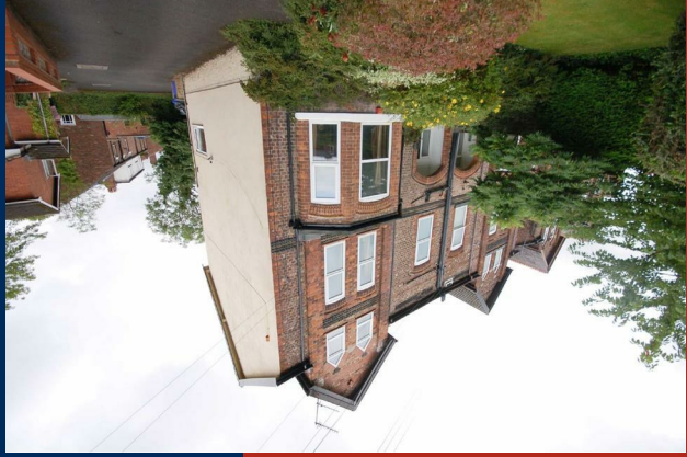
EPC Rating - D

Available with Deposit No deposit needed