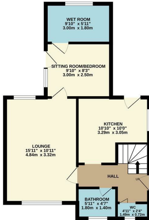
GROUND FLOOR 508 sq.ft. (47.2 sq.m.) approx.