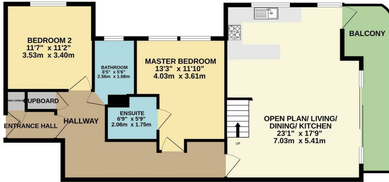
MEZZANINE LEVEL 225 sq.ft. (20.9 sq.m.) approx.