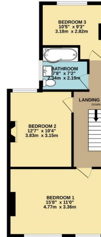
1ST FLOOR 516 sq.ft. (47.9 sq.m.) approx.