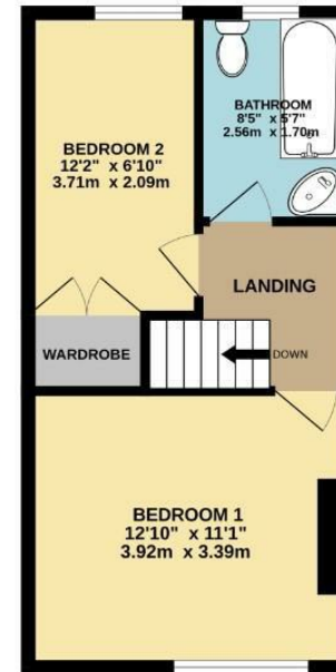
1ST FLOOR 335 sq.ft. (31.1 sq.m.) approx.