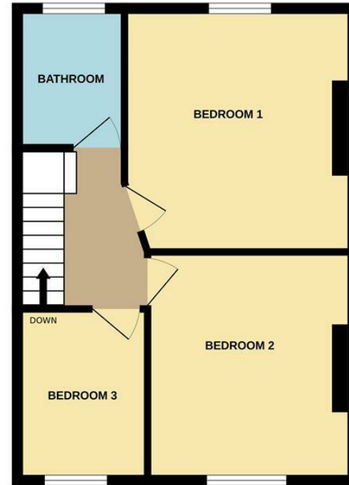
1ST FLOOR 435 sq.ft. (40.4 sq.m.) approx.