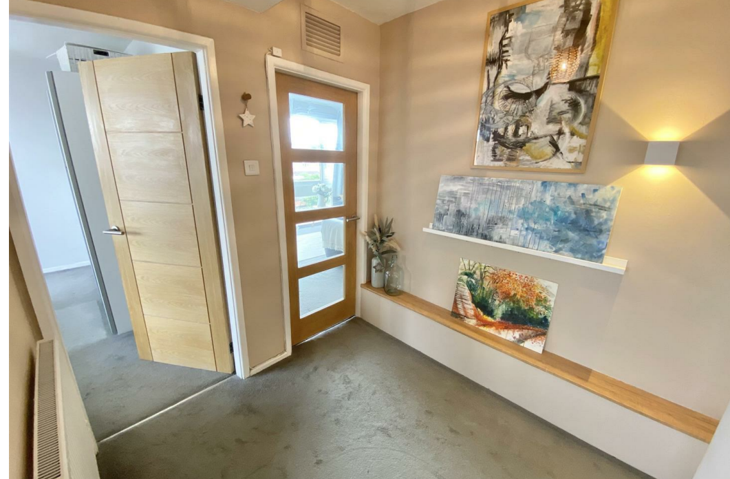
SECOND FLOOR APARTMENT 771 sq.ft. (71.7 sq.m.) approx.