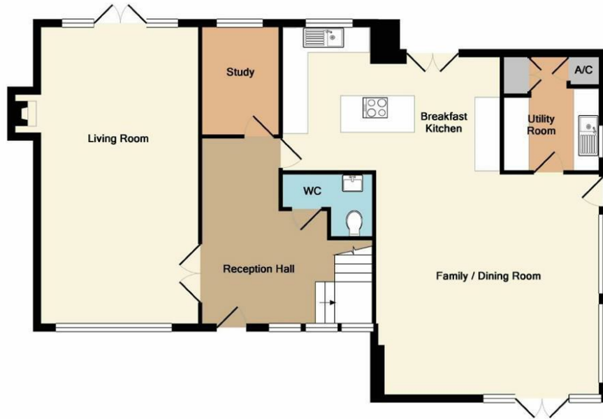
GROUND FLOOR APPROX. FLOOR AREA 1126 SQ.FT. (104.6 SQ.M.)