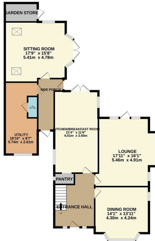
GROUND FLOOR 1361 sq.ft. (126.4 sq.m.) approx.