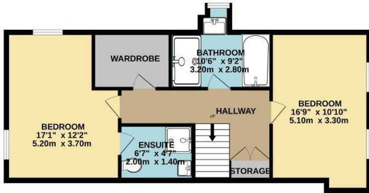
LOWER GROUND FLOOR 674 sq.ft. (62.6 sq.m.) approx.