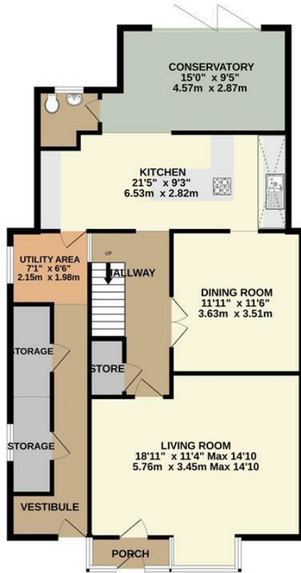
GROUND FLOOR 1106 sq.ft. (102.7 sq.m.) approx.