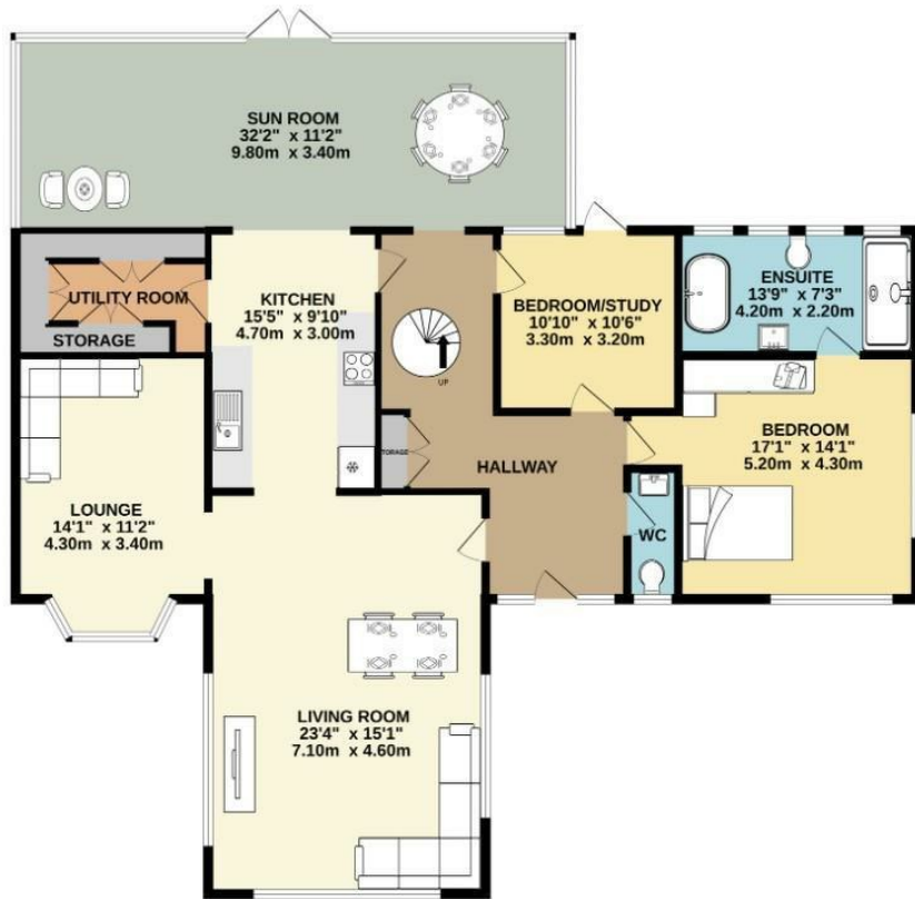
1ST FLOOR 661 sq.ft. (61.4 sq.m.) approx.