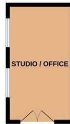
1ST FLOOR 541 sq.ft. (50.2 sq.m.) approx.