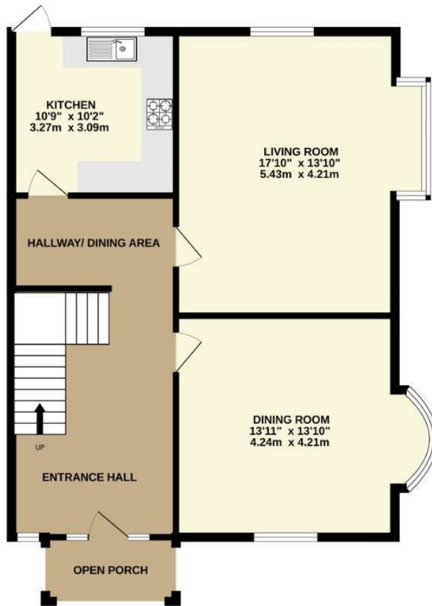
GROUND FLOOR 824 sq.ft. (76.6 sq.m.) approx.