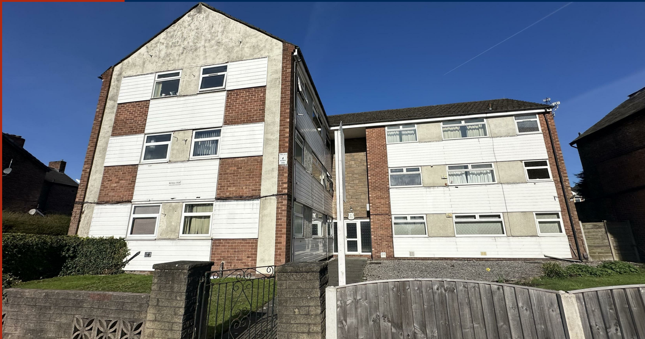
Flat 22 Old Hall Court, Sale, M33 2HP