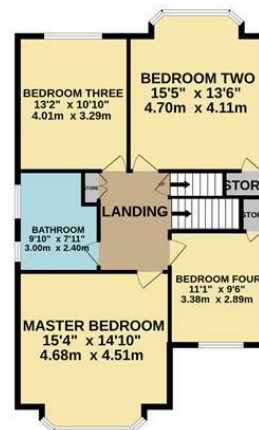
1ST FLOOR 660 sq.ft. (61.3 sq.m.) approx.