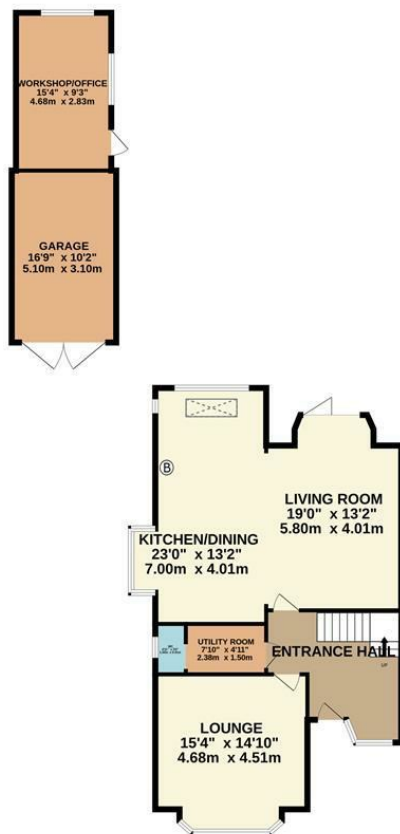
GROUND FLOOR 1225 sq.ft. (112.5 sq.m.) approx.