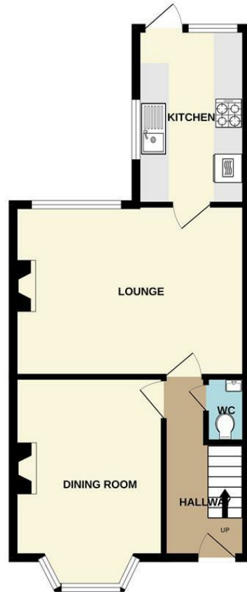
GROUND FLOOR 466 sq.ft. (43.3 sq.m.) approx.