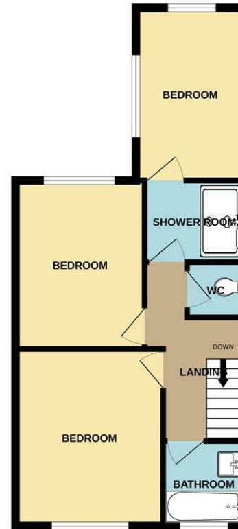
1ST FLOOR 464 sq.ft. (43.1 sq.m.) approx.