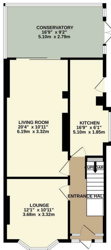
GROUND FLOOR 684 sq.ft. (63.5 sq.m.) approx.