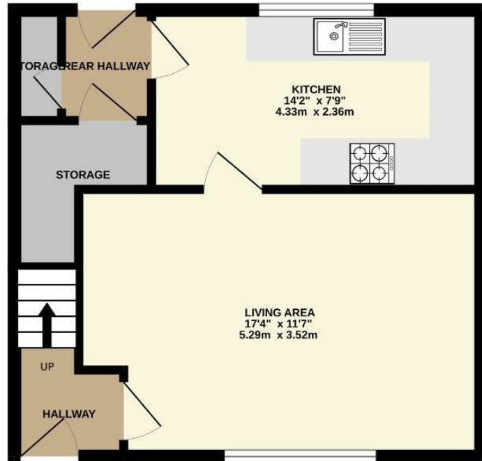
GROUND FLOOR 388 sq.ft. (36.0 sq.m.) approx.