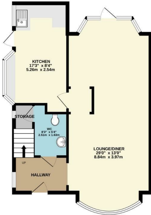
1ST FLOOR 581 sq.ft. (53.9 sq.m.) approx.