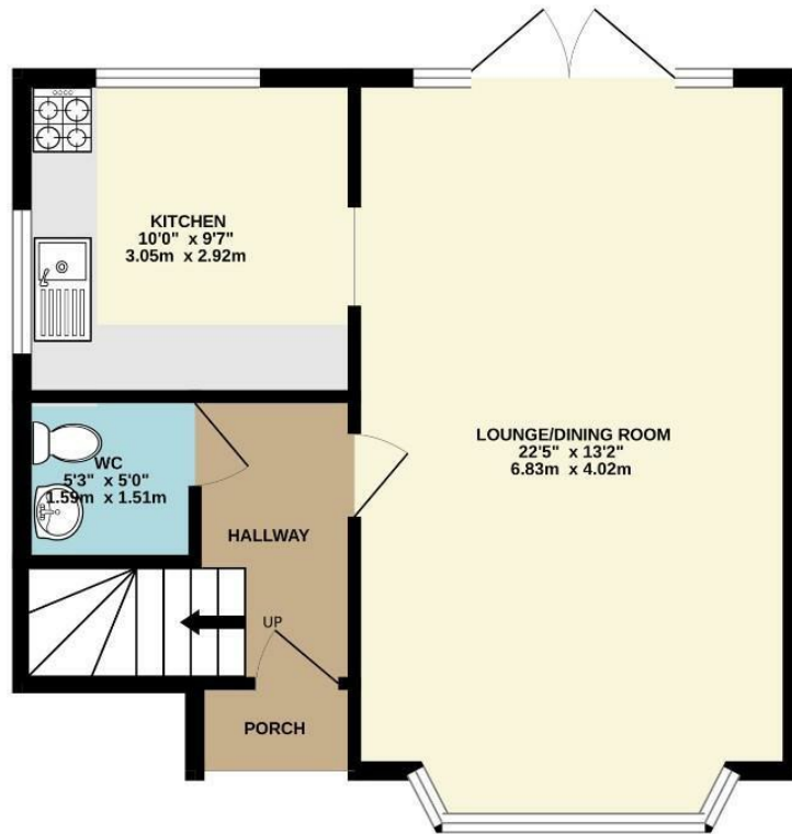
GROUND FLOOR 484 sq.ft. (45.0 sq.m.) approx.