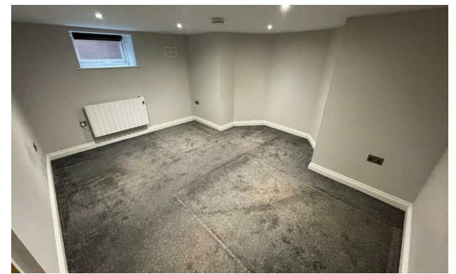
BASEMENT LEVEL 791 sq.ft. (73.5 sq.m.) approx.