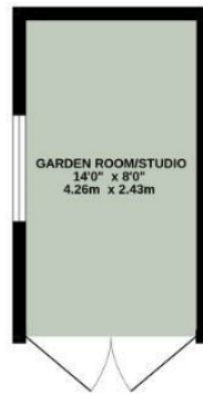
GARDEN ROOM 112 sq.ft. (10.4 sq.m.) approx.