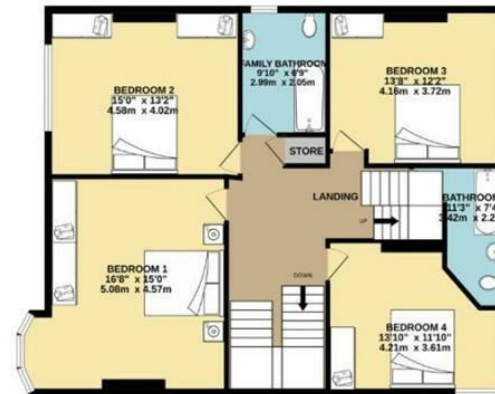
1ST FLOOR 1069 sq.ft. (99.3 sq.m.) approx.