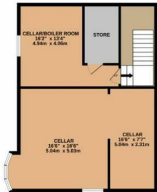
BASEMENT LEVEL 969 sq.ft. (89.2 sq.m.) approx.