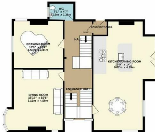
GROUND FLOOR 1123 sq.ft. (104.3 sq.m.) approx.