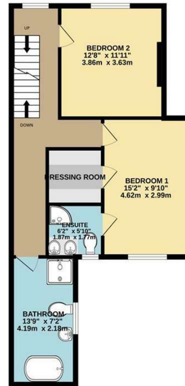
1ST FLOOR 619 sq.ft. (57.5 sq.m.) approx.