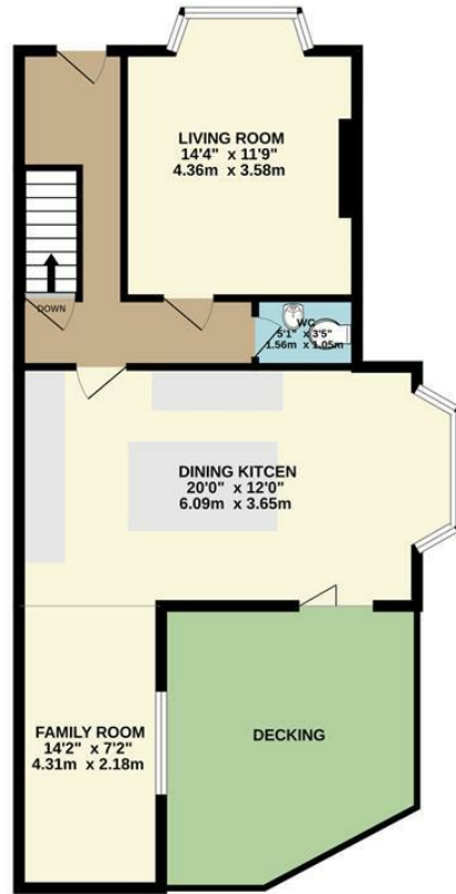
GROUND FLOOR 634 sq.ft. (58.9 sq.m.) approx.