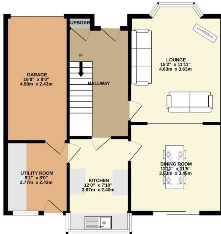
GROUND FLOOR 717 sq.ft. (66.6 sq.m.) approx.