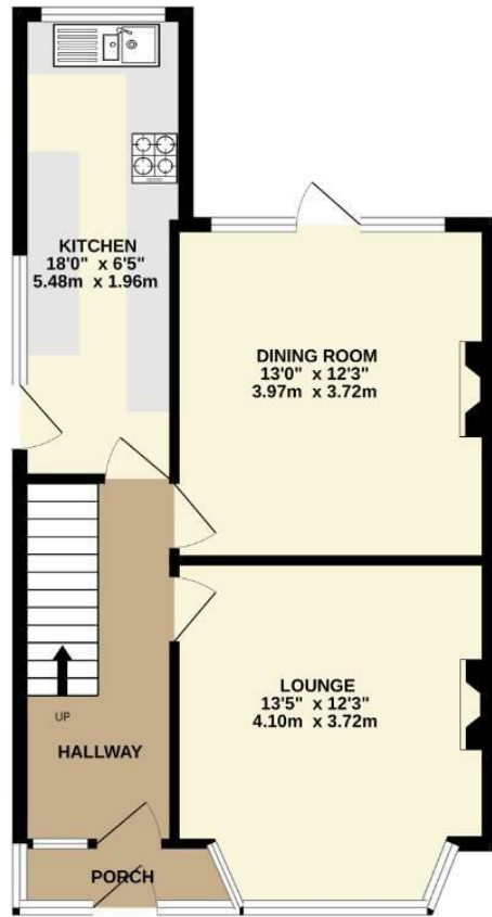
GROUND FLOOR 524 sq.ft. (48.7 sq.m.) approx.