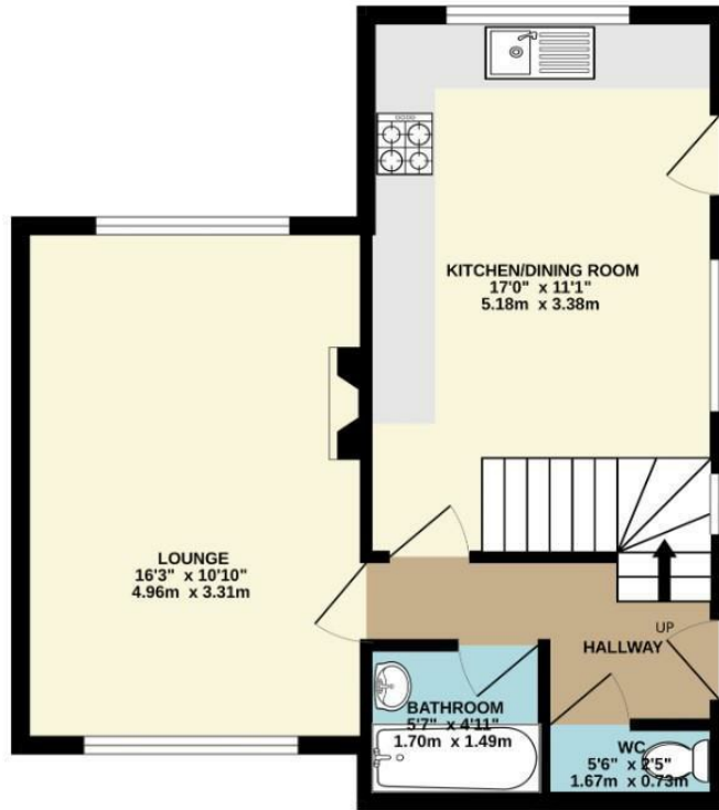
GROUND FLOOR 450 sq.ft. (41.8 sq.m.) approx.