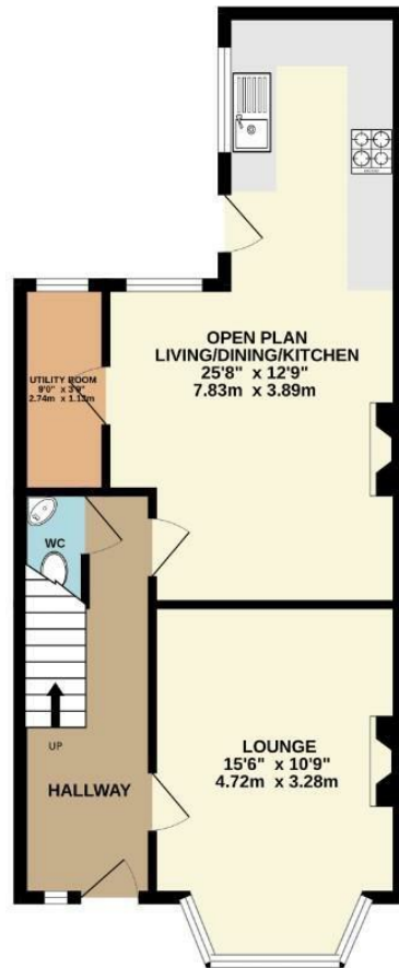
GROUND FLOOR 540 sq.ft. (50.1 sq.m.) approx.