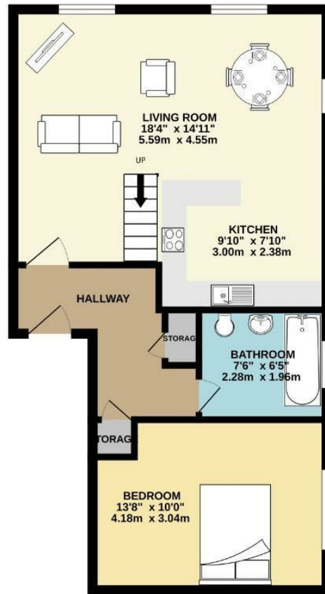
GROUND FLOOR 553 sq.ft. (51.4 sq.m.) approx.